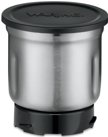
CAC103 Stainless Steel Bowl with Lid